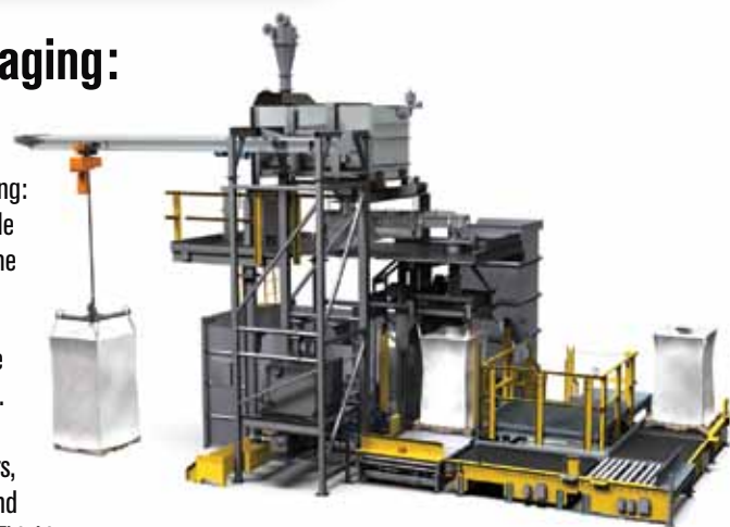
From automated bulk material processing systems to single bulk material handling units, NBE Forward Thinking will ensure trouble-free system start-up and reliable, on-going performance.

With over 15,000 installations worldwide, NBE bulk material processing systems have proven their ability to maximize process capacity and improve total line performance. The full line of NBE material handling equipment and automated processing systems includes: bulk bag dischargers, bulk bag fillers, container dischargers, container fillers, conveyance systems, storage, mixing and blending, NTEP-certified weigh systems, and automation control design and manufacturing. Look ahead to NBE. Look to Forward Thinking.